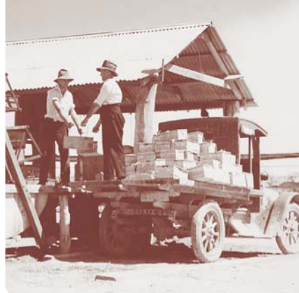
The Mildura Co-operative Fruit Company, Mildura, Victoria.

ADFA membership includes both growers and processor/marketers. There are currently about 1,000 dried grape growers, many of whom are members of ADFA. Australia's largest processor/marketer, Sunbeam Foods, is a member of ADFA and is represented on the ADFA Board of Management.